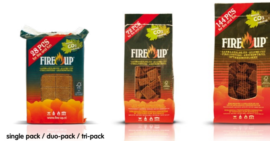
single pack / duo-pack / tri-pack